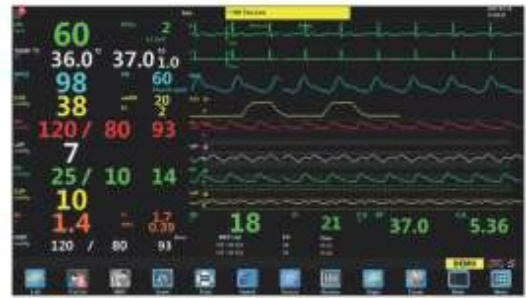
4 channel IBP