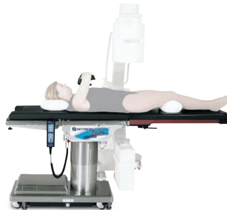
Lower Body Imaging