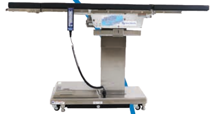
3503 EZ Slide