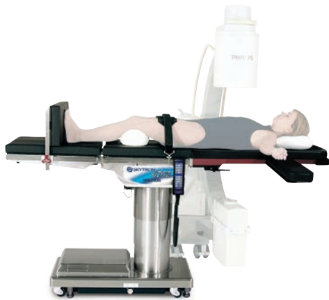
Upper Body Imaging