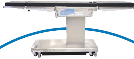
3603 Ultra Slide